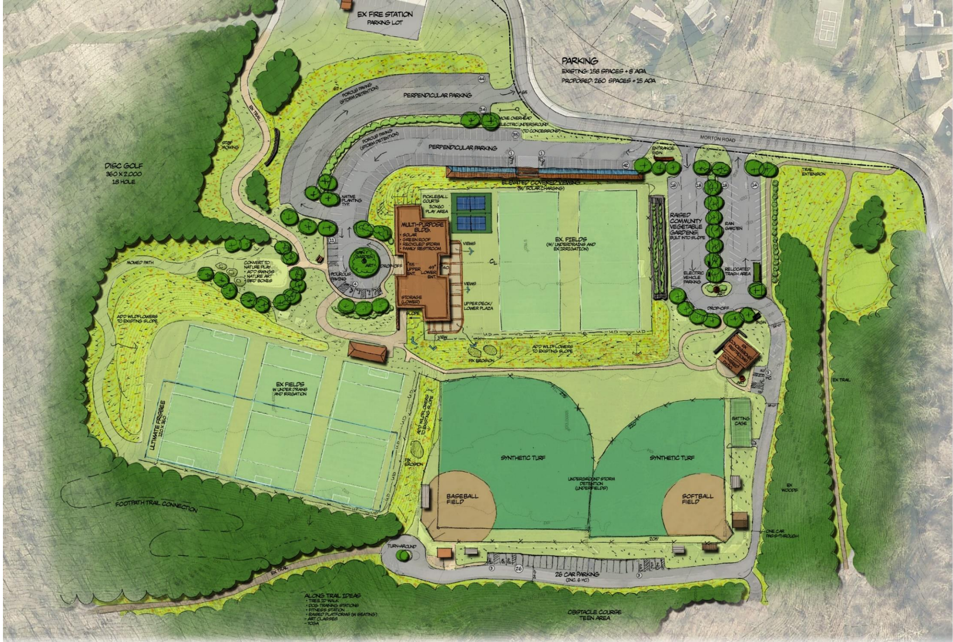
Morton Field Complex 1 st Rendering